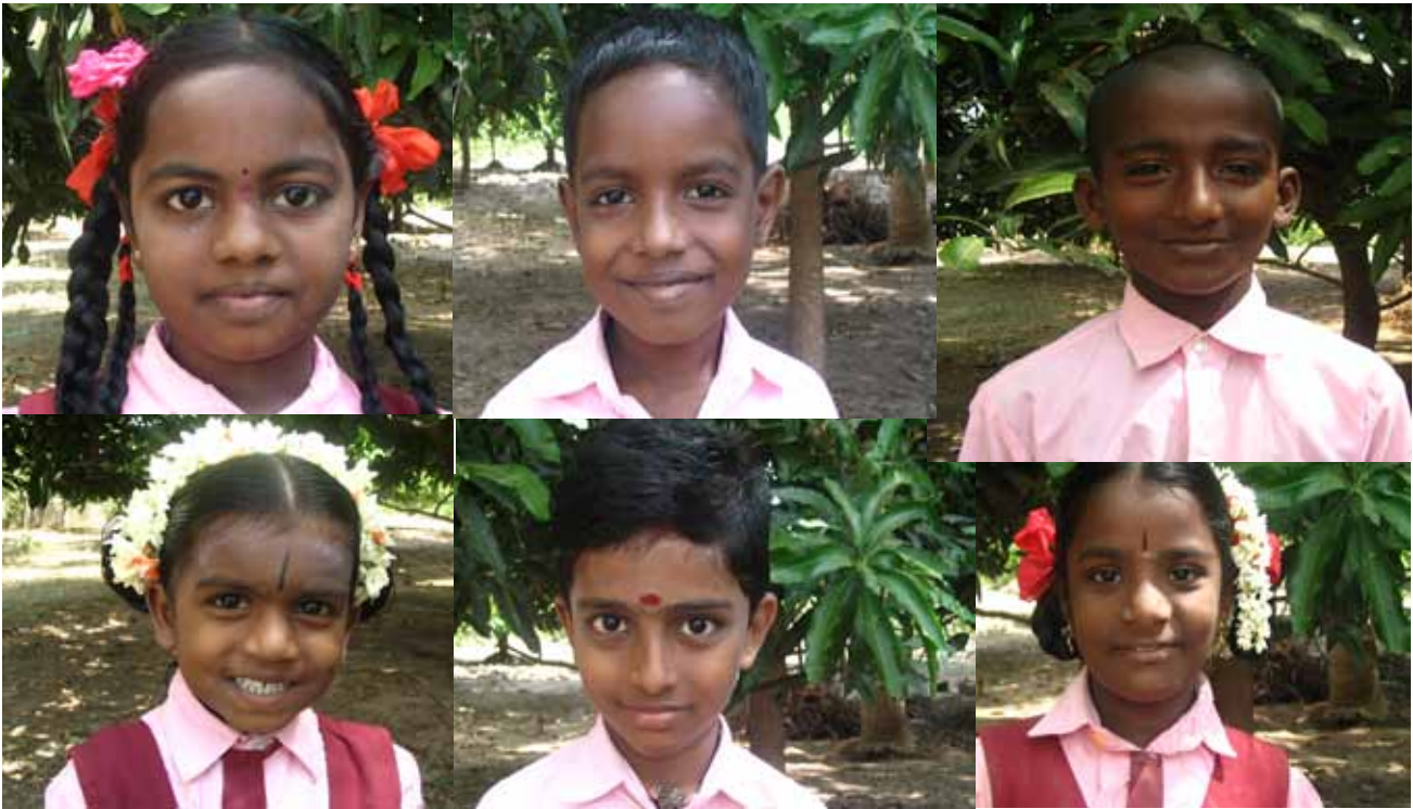
Children of the Mother Teresa School of Periyakrishnapuram. The school is currently run in a hut with thatched-leaf roof. Construction of a much-needed new school building was started in 2007 with support from Sahaya International (USA) and SAWES (Belgium). The school is expected to be completed in 2008.