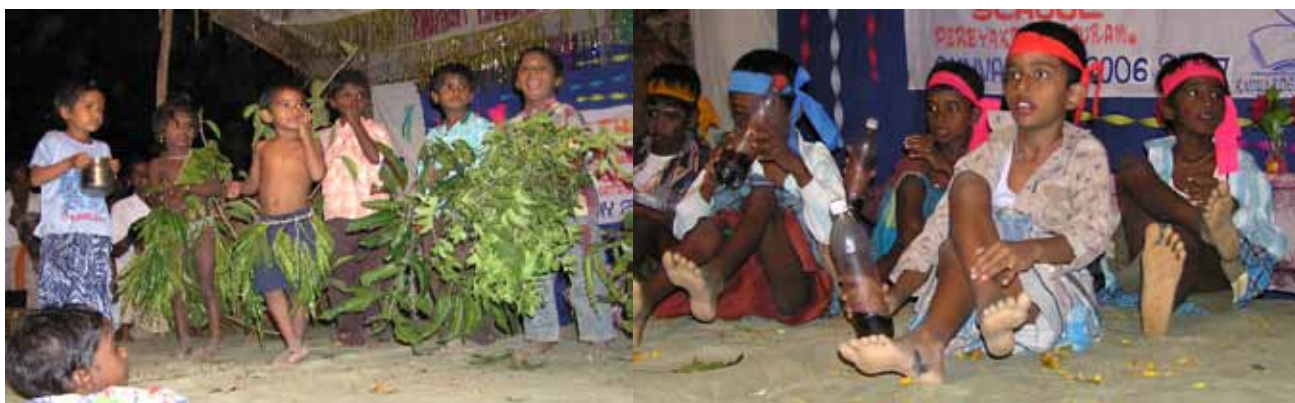
The children of the Mother Teresa School go green and dance at their Annual Day (February 15, 2007).

activities. To honor the disabled people, the World Disability Day was celebrated during December 2006.