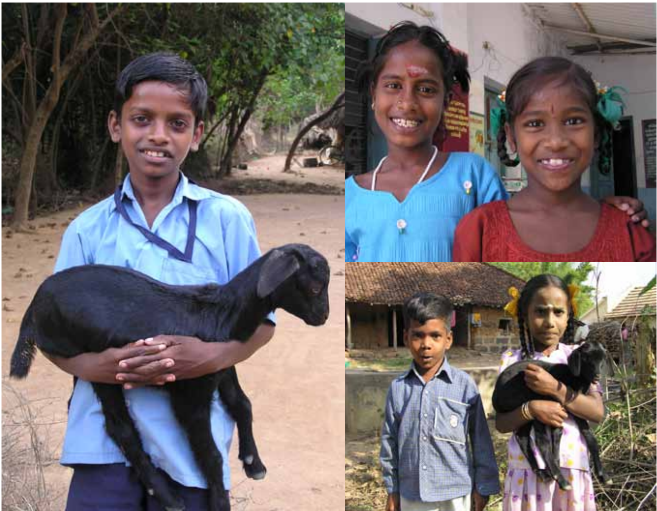
Our orphan sponsorship programs benefit many children and also provide their families with money to start an income-generating activity, such as rearing goats.