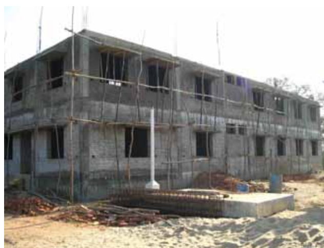
Construction of the Resource Center

READ is the District Resource Center for TNVHA, Chennai's activities. In partnership with TNVHA, READ undertook a care and support program for PLWHA (People living with HIV/AIDS) in this reporting year. TNVHA provided Rs. 2500 to 4 PLWHA for small income-generating activities like buying goats, chicks etc., This year, to commemorate the World AIDS Day, we have organized an HIV/AIDS awareness rally, which was sponsored by IHN- APAC, Chennai.