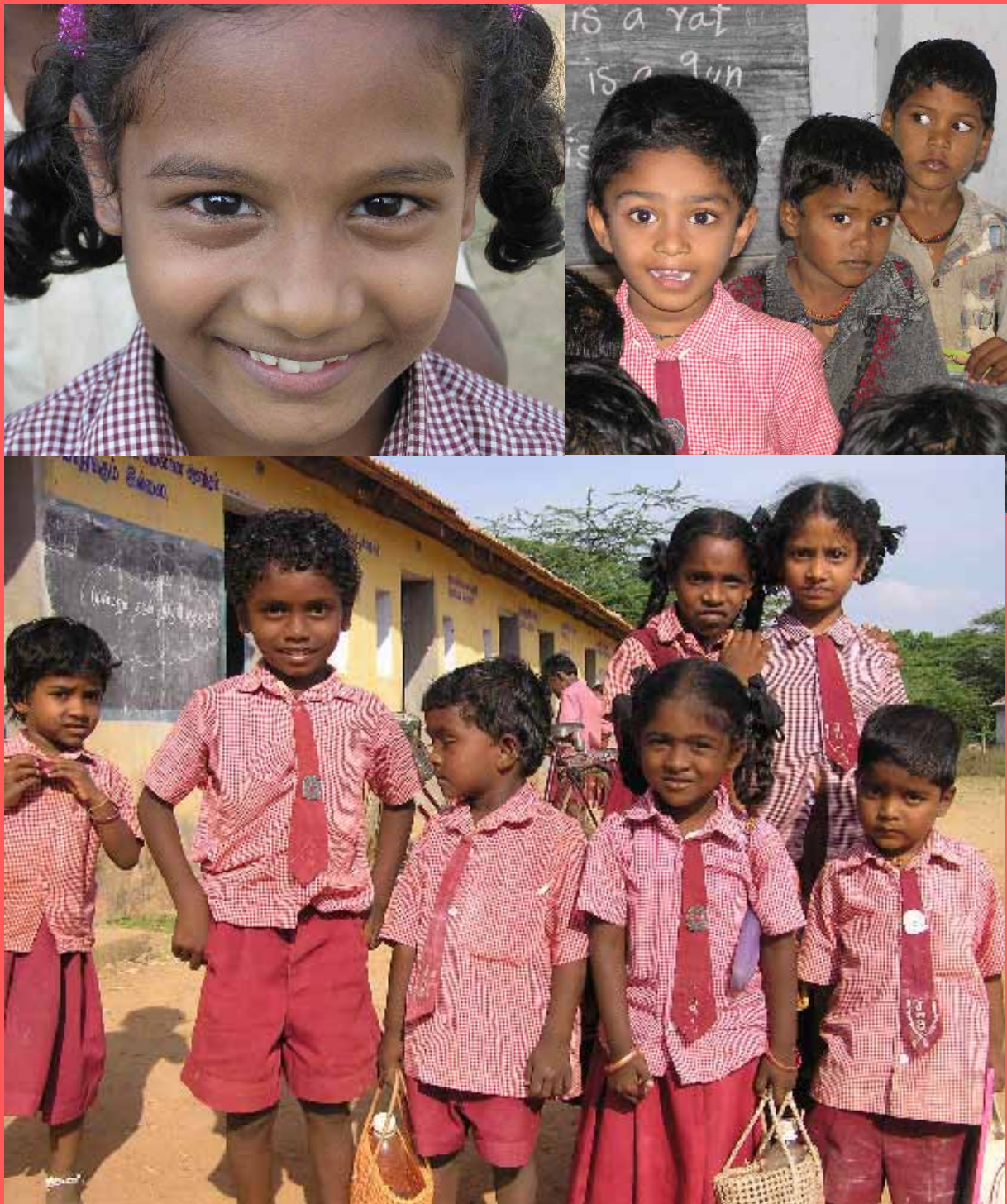
Children of the Jawahar Matriculation School, which provides basic education to 60 children. The school is currently run in a rented building, which will be demolished soon. A new school building is scheduled to be constructed in 2008 with support from Sahaya International and its network of volunteers and donors in the USA and Belgium.